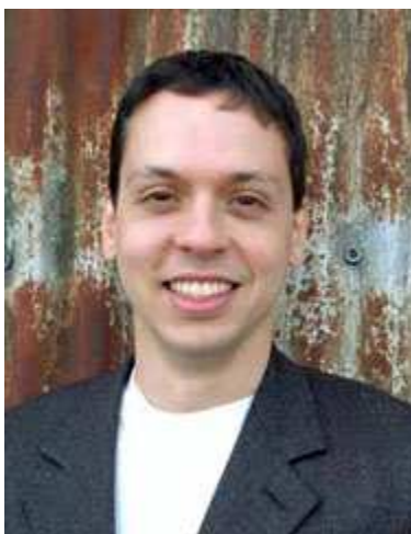
Markos Moulitsas: Founder of Daily Kos, The Most-Read Political Blog in The World

Markos Moulitsas , my favorite national political blogger and founder of the Daily Kos , is coming to Fayetteville on October 24th , speaking up on the UA campus at 7:00 p.m. in the J.B Hunt Building, across Dickson Street from the Greek Theater. It is free and open to the public.